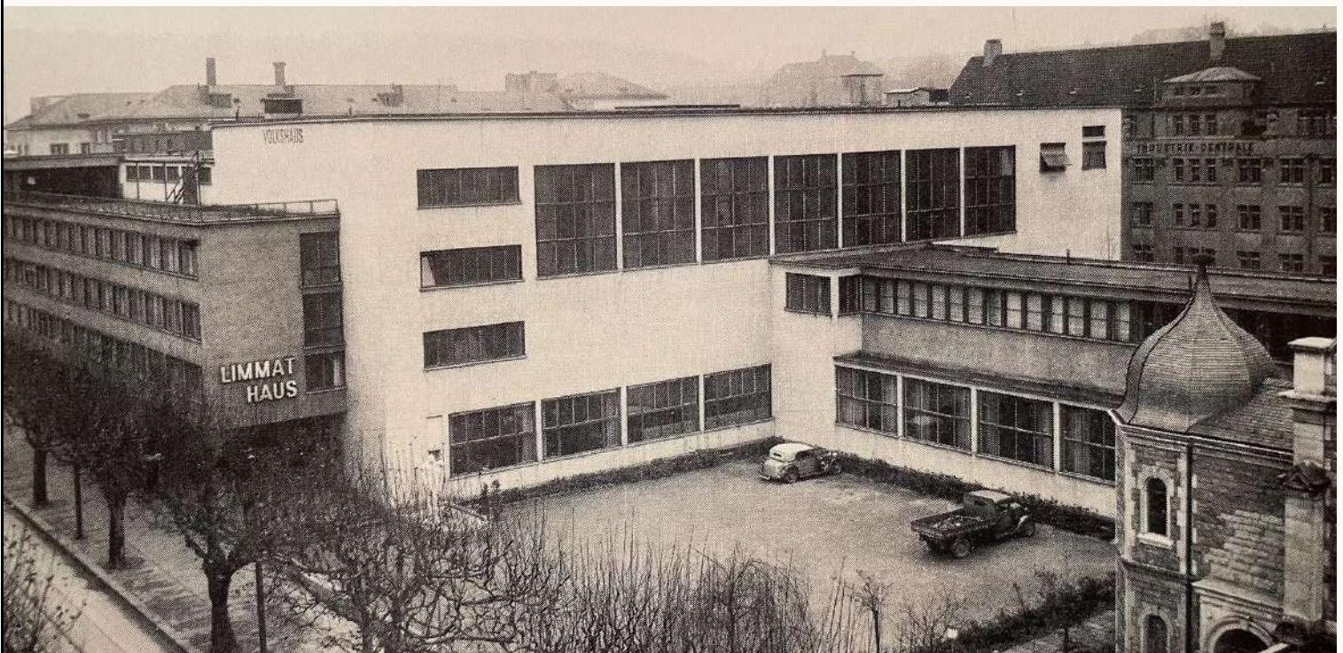
HISTORICAL IMAGE FROM CA. 1940

It was to be a place of encounter as well as socio-cultural exchange—a meeting space for political and social life, but also for everyday interactions. From the very beginning, the building housed a post office and a restaurant.