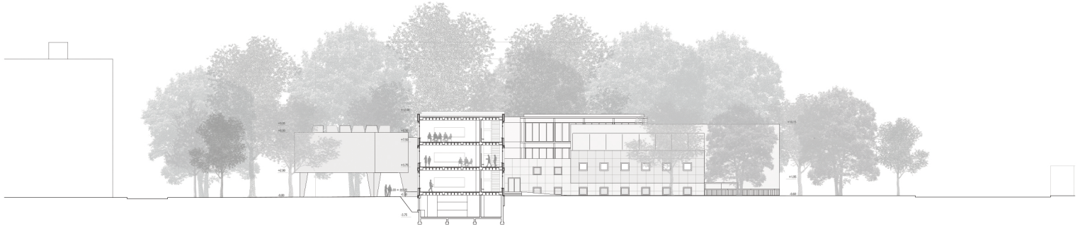
Coupe BB 1/200