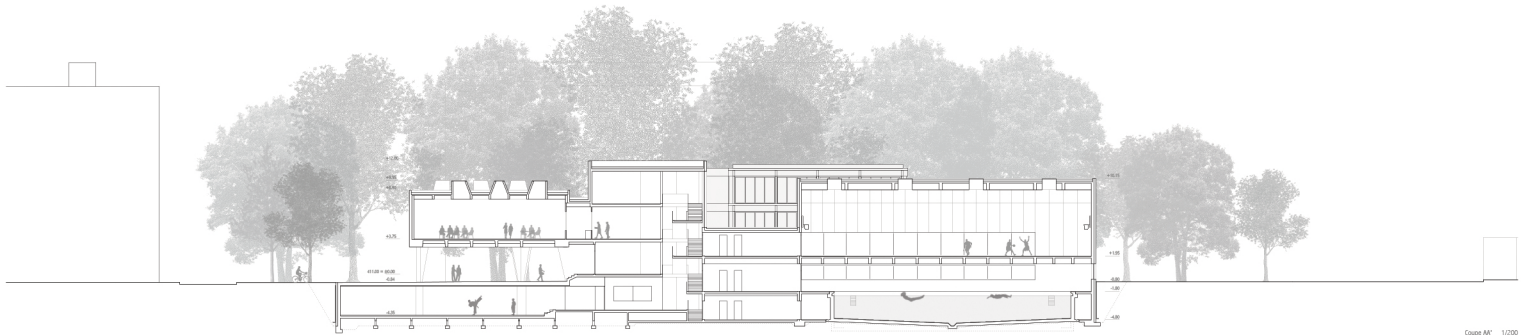
Coupe AA 1/200